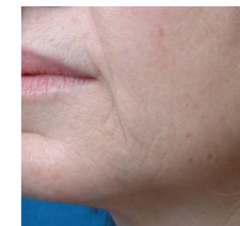
4 Weeks After 8 Treatments