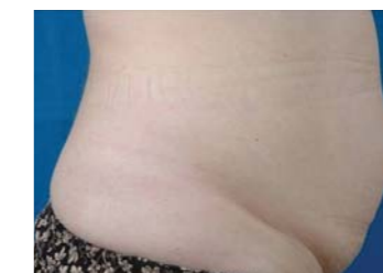
2 Months After 3 Treatments